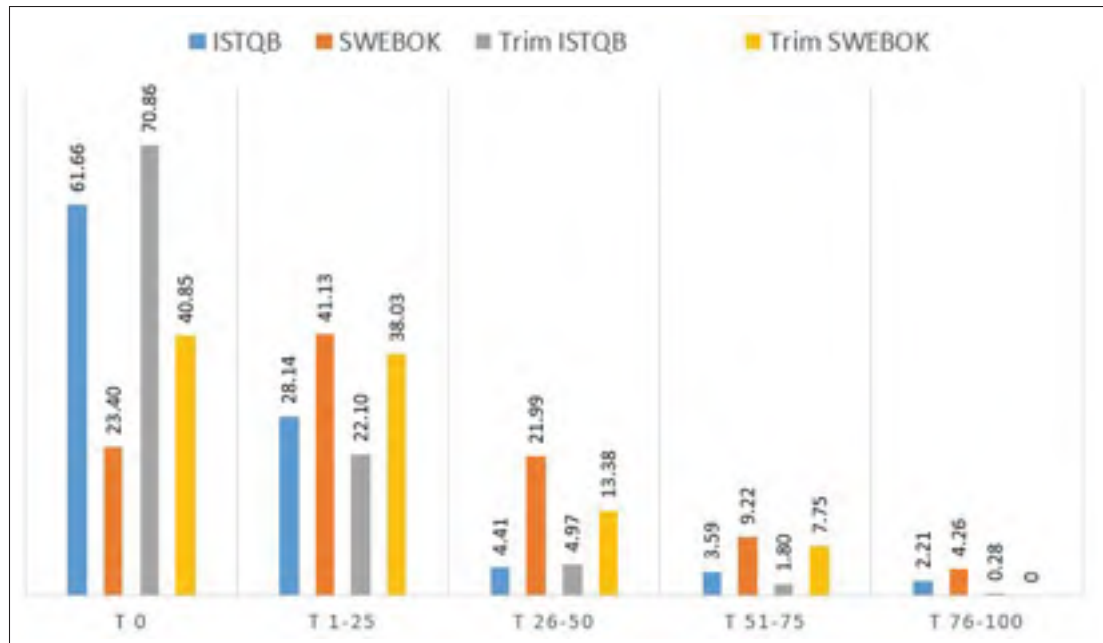
Figure 3.3 Distribution of learning resources' terms relative to the percentage of tools they appear in

of trimmed logs and thus consequently provide more discussion about them. Note finally that, to ease the reading, we put in italic terms worth highlighting.