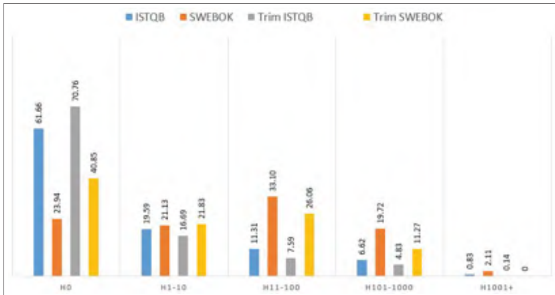
Figure 3.1 Distribution of learning resources' terms relative to their total hits

appear between 101 and 1000, and v) H1001+: the set of terms that appear more than 1000 times. The first important observation is a binary one and refers to whether a term appears or not in the release documentation. Looking at H0, we can see that 62% of ISTQB terms and 24% of SWEBOK terms do not appear in the raw logs. Unsurprisingly, the percentages are even higher for the trimmed (i.e., less noisy) versions of the logs: 71% of the ISTQB terms and 41% of the SWEBOK terms have zero occurrences.