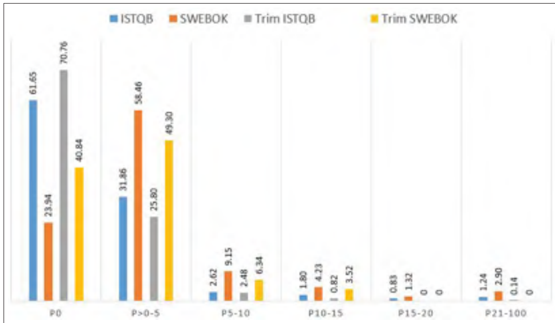
Figure 3.2 Distribution of learning resources' terms relative to the percentage of versions they appear in

that we can find much higher percentages of terms in higher categories; meaning many terms are indeed mentioned in a large number of tools, even if they are not necessarily mentioned in most versions.